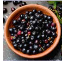
Maqui Berry Aristotelia chilensis