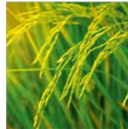
Rice Bran Solubles Oryza sativa