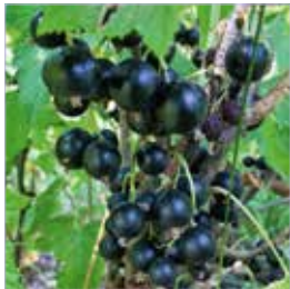
Black Currant Ribes nigrum