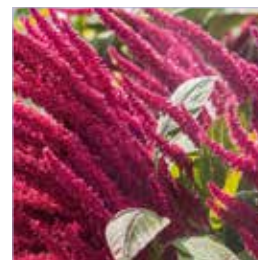
Amaranth Amaranthus spinosus