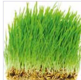
Oat Grass Avena sativa