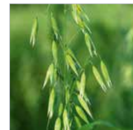
Oat (gluten free) Avena sativa