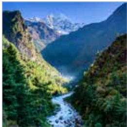
Fulvic & Humic Acid