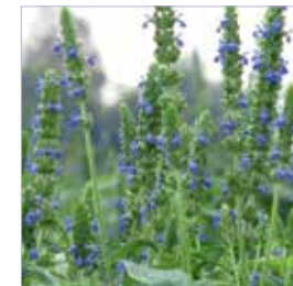
Chia Seeds Salvia hispanica