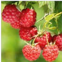
Raspberry Rubus idaeus