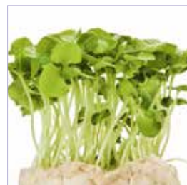
Alfalfa Medicago sativa