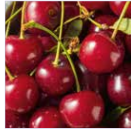
Tart Cherry Prunus cerasus