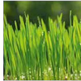
Wheat Grass Triticum aestivum