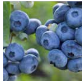
Blueberries Vaccinium corymbosum