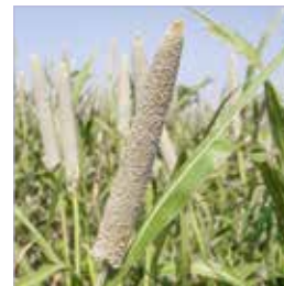
Millet Panicum milliaceum