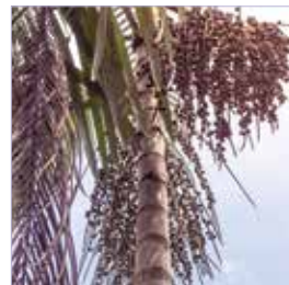
Acai Berries Euterpe oleracea