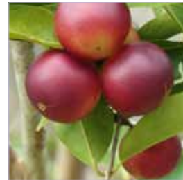
Camu-Camu Myrciana dubia