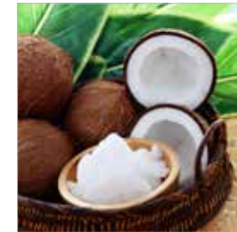
Coconut-MCT Oil Cocos nucifera