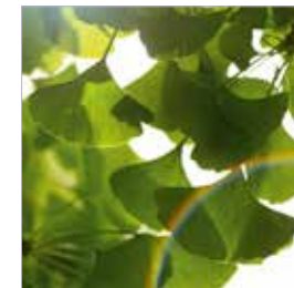
Ginkgo Ginkgo biloba