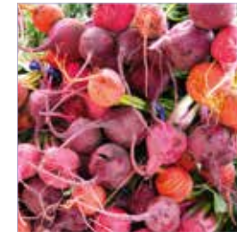
Beet Juice Beta vulgaris