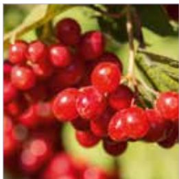
Cranberries Vaccinium macrocarpon