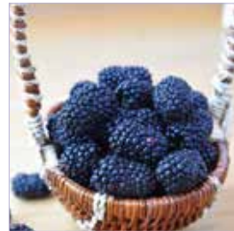
Blackberry Rubus fruticosus