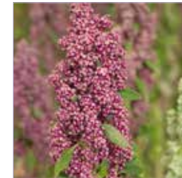
Quinoa Chenopodium quinoa