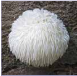
Lion's Mane Mushroom Hericium erinaceus