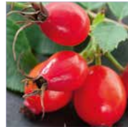
Rosehips Rosa canina