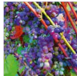
Red Grapes Semen vitis vinifer