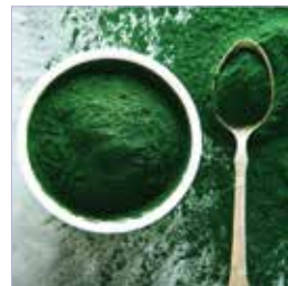
Spirulina Arthrospira platensis