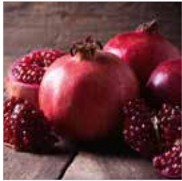
Pomegranate Punica granatum