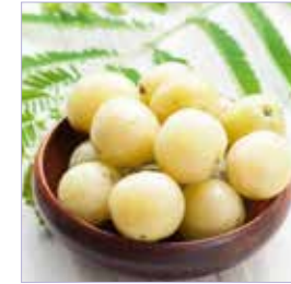
Amla fruit Phyllanthus emblica