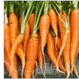
Carrots Daucus carota