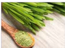
Barley Grass Hordeum vulgare