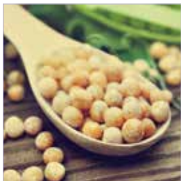
Pea Protein Pisum sativum